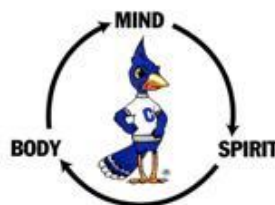
Campus Rec Billy Bluejay Logo